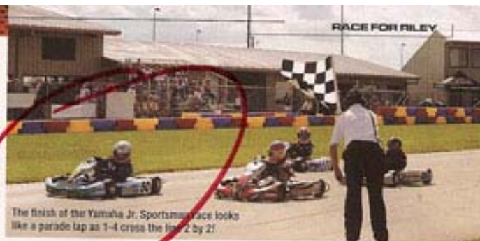
The finish of the Yamaha Jr. Sportsman race looks like a parade lap as 1-4 cross the line 2 by 2!